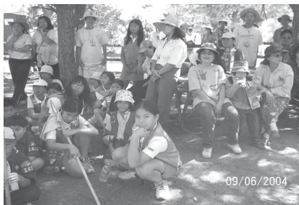
LK X - Trời nắng quá, khi nào chào cờ?