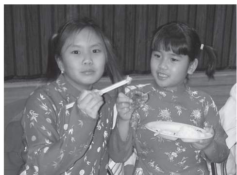
Miếng này chia nhau

It's the 25th Anniversary of Lien Doan Truong Son! I like being a Truong Son Scout because of all the fun things we do. For instance, one of the most memorial moments in my life was when the Brownies went to the Boat-O-Rama last year. We went to a lake where we saw tons of cool shells and boats. But the best part was actually boating across the lake. While paddling, I saw a HUGE silverfish leap out of the water like dolphins.