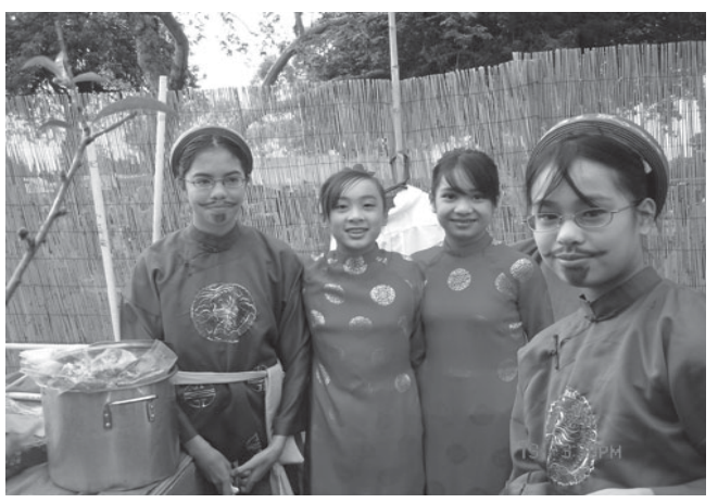
Anh đưa nàng dìa ... vinh