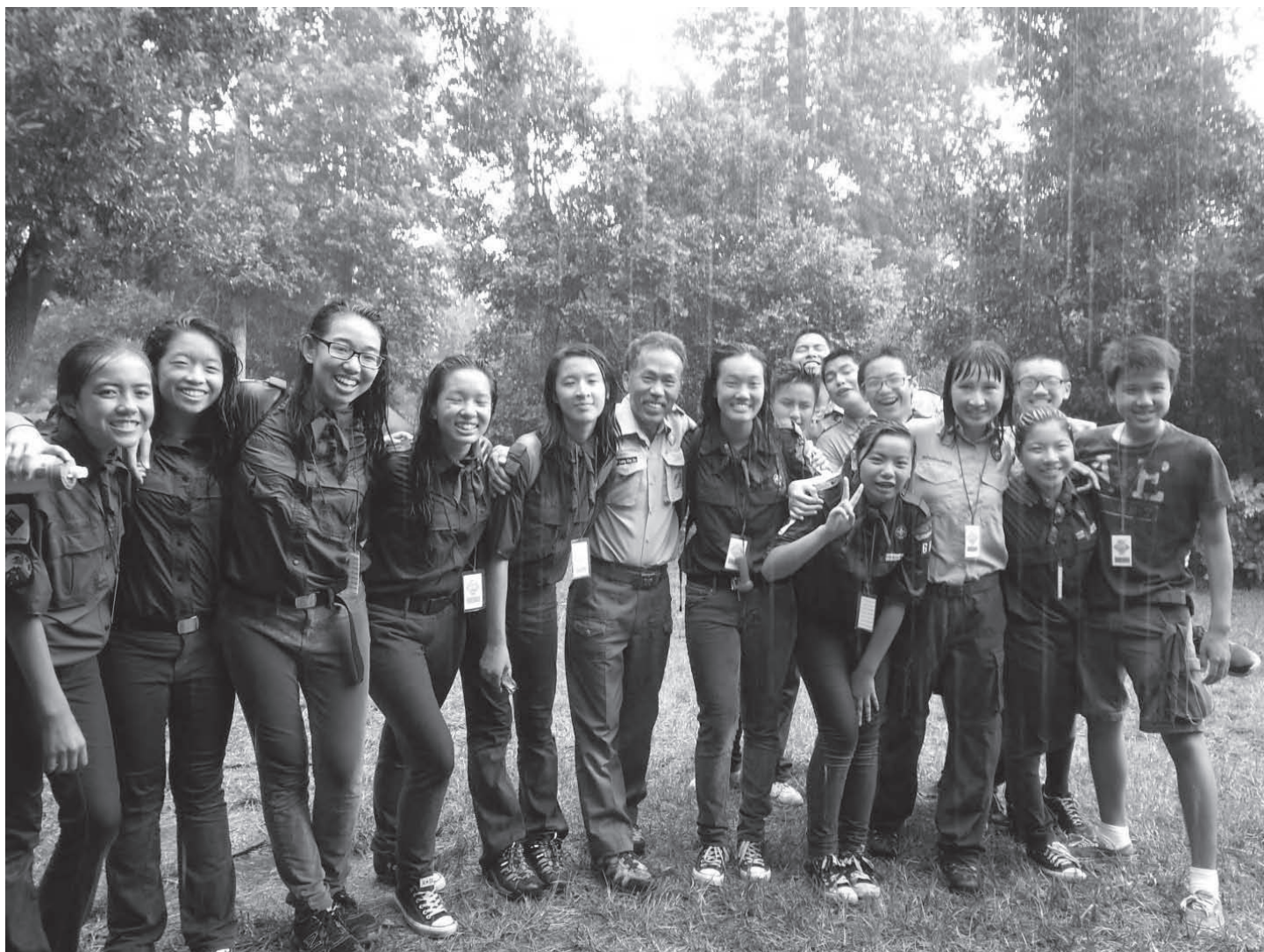
Trại Thăng Tiến X

Trời mưa, dzô ta! Thì mặc trời mưa, dzô ta! Nhưng lòng cương quyết, dzô ta! Trời mưa ngại gì, dzô ta cái hò dzô ta, dzô ta!