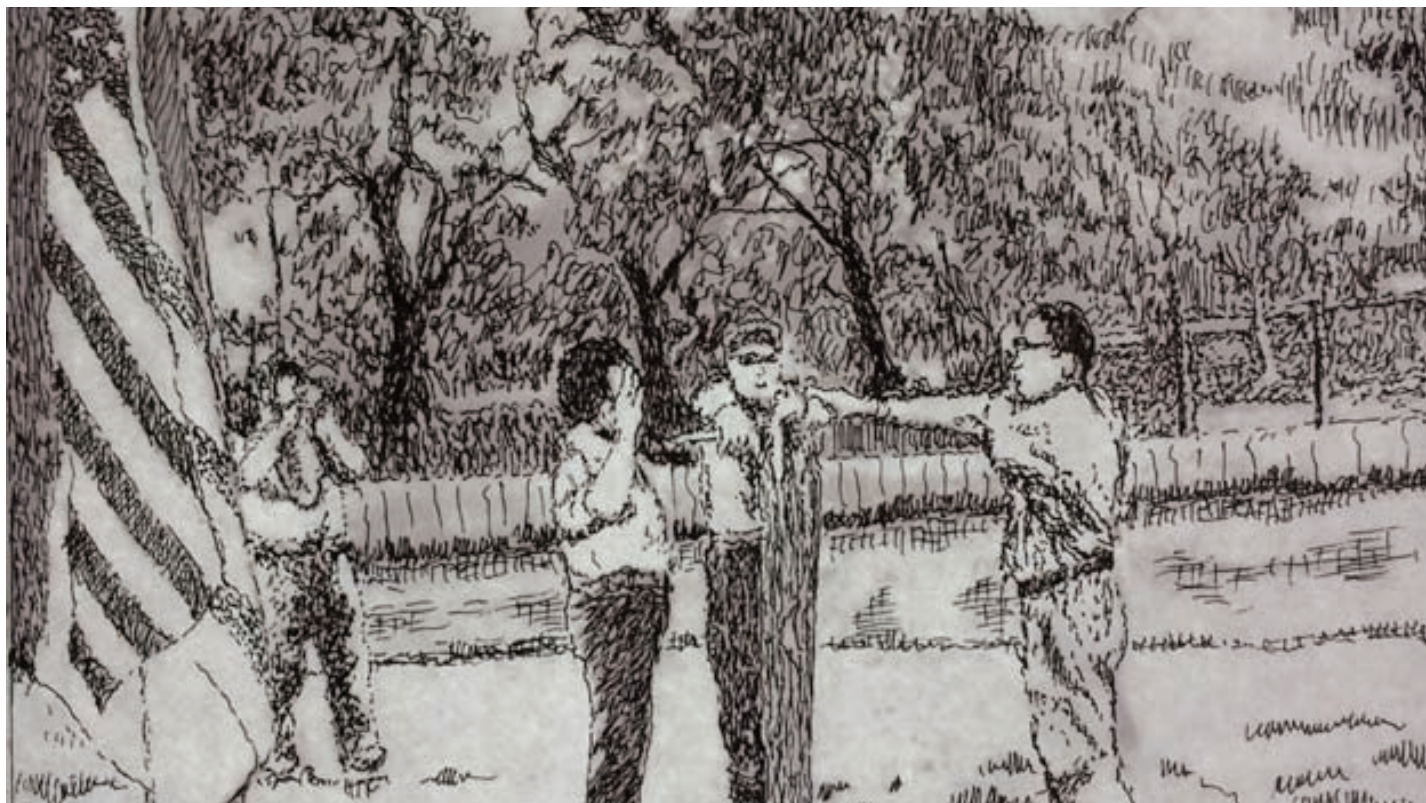
Lễ Tuyên Hứa Hướng Đạo