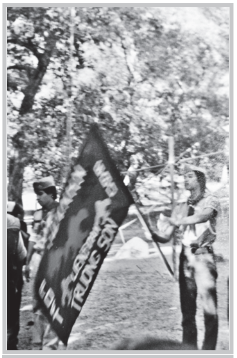
First Trường Sơn Unit Flag

Scouting Units from Los Angeles, Orange, and San Diego counties participate in the Annual Vietnamese Camporee (Trai Liên Kết). It should be noted that Liên Đoàn Trường Sơn often visited, went camping with other Scouting Units, and also open its doors with open arms to many organizations in the community, including Vietnamese Student Associations, Buddhist Family, and Catholic Youth Group.