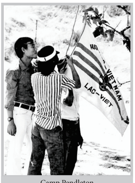
Camp Pendleton First Scout Unit Lac Viêt