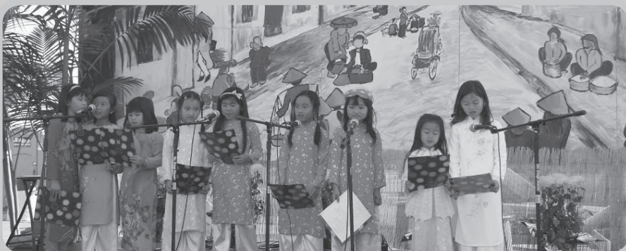
Singing at Hoi Cho Tet