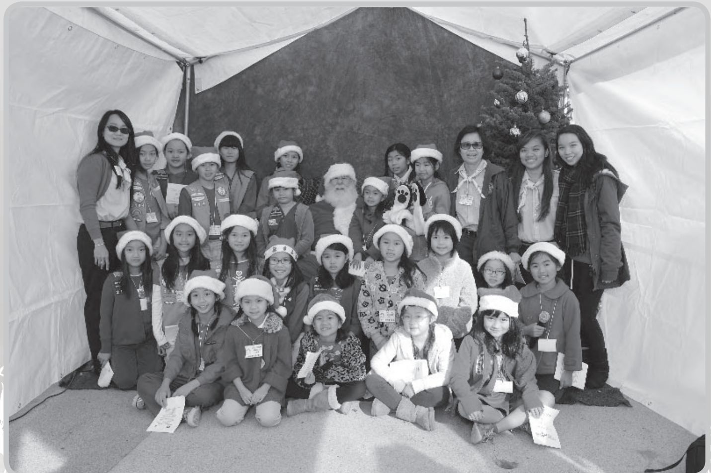
Brownies and Juniors with Santa Claus Christmas Caroling 2014