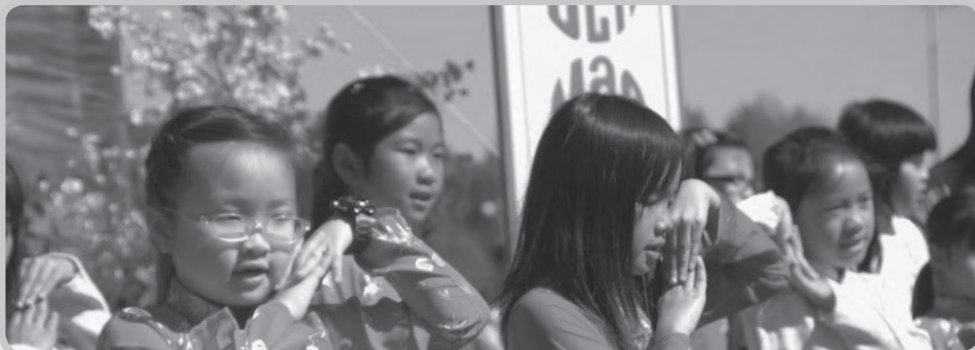
Dancing at Hoi Cho Tet

My feeling about Scout is good because I meet new friends. Scout teaches me to be honest. I like most in Scout is the Tết Festival at Liên Đoàn because there is food and a raffle and Lì Xì. When I go to Scout the special thing is my friends.