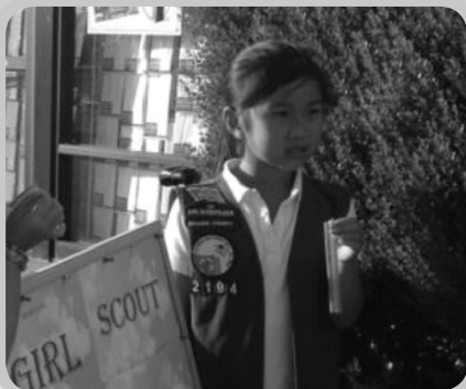
Girl Scout Cookie Sales