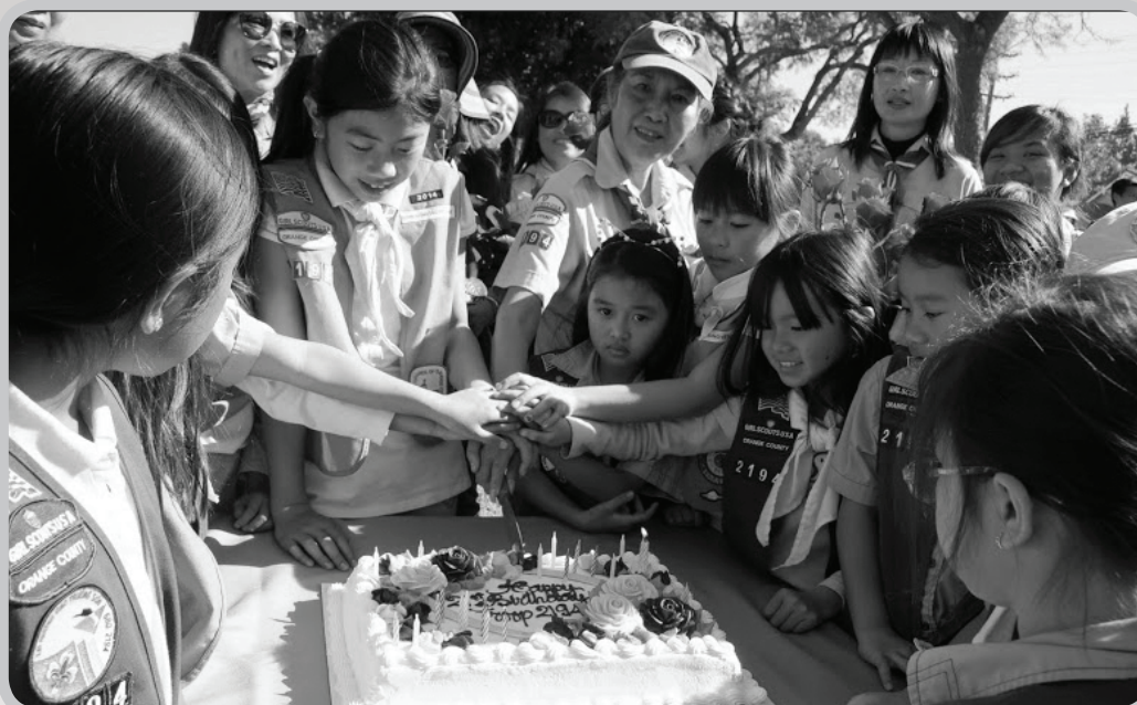
Happy Birthday Troop 2194 !!!

I like the Tết Festival because we get Tiền Lì Xì and we get to sing, to dance and performance. I also like to go caroling for the Christmas Program. Singing and dancing are fun.