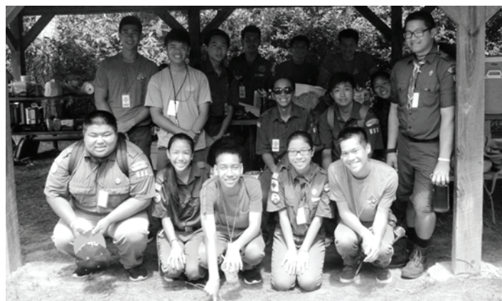
Our Crew at TT10