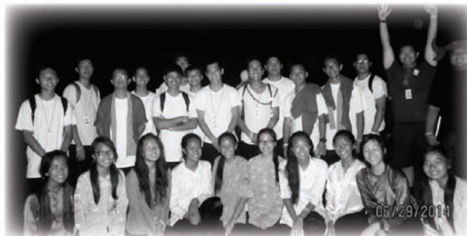
Show Time at TT10