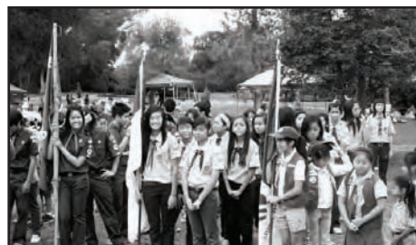
Truong Son Girl Scouts (Seniors, Cadettes, Juniors and Brownies) at Chào Cờ Đầu Năm