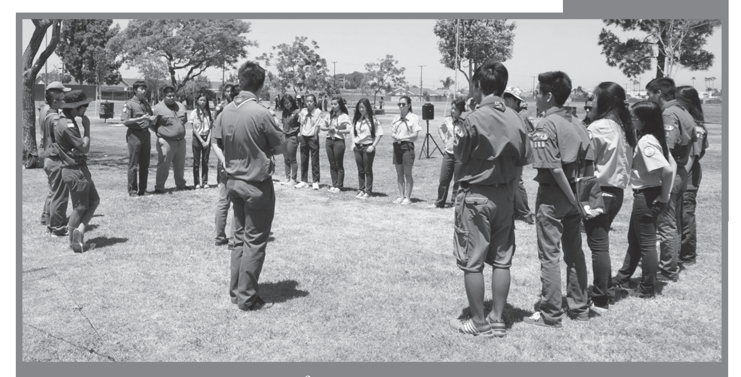
Sinh Hoạt buổi sáng của các em Thanh Sinh